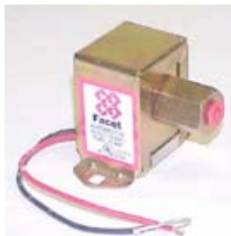
Figure #8 – The right size 12 volt electric pump can be a wise addition to any fuel system when properly installed.

Electric Fuel Pumps: A lot of operators like the ideal of an electric 12-volt DC fuel pump. Starting is easier because the Carb float bowl can be filled before grinding the starter. Facet makes a compact little solid-state unit that does an excellent job of delivering about 5 psi to the Carb. See figure #8. Unfortunately these pumps are sealed and are not rebuildable.