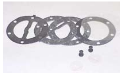
Figure #7 – The dual pump rebuild kit includes four gaskets, a clear diaphragm, and a pair of disc valves as shown.

Mikuni Dual Round Pump: Prepare a work area as described above. The pump has three separate aluminum sections. Mark them with a felt pen or scribe line so you can reassemble the pump with all ports pointed the same direction as when you started. Remove the rack of six screws and remove the top plate only. Remove the gaskets and lay out in order they are removed. Note that one gasket is a thick paper gasket and one is a thin rubber gasket. Note the indicator tab on both gaskets that line up with the tab on the exterior of the top cover. Remove the center body, diaphragm, and gaskets from the base of the pump body. Again lay them out in the order they were removed. Using a small diameter rod push both rubber keepers out of the valve body and remove the round clear plastic valves. Take a minute to look at these valves and how they function. They are a bit more sophisticated in design than the flapper valves found in the rectangular pumps but still made of the same clear material. Also note that the outlet ports come from a common chamber, so plugging one off or routing them back together for use on a single Carb application makes little difference.