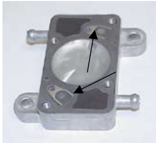
Figure #6 – Rectangular pumps use a pair of flapper valves that are nothing more than a ¼" wide flap of clear plastic material to create a one way flow. Insanely simple !!