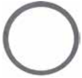
FUEL PUMP GASKET - 649962