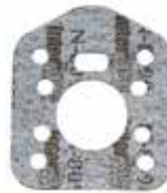
LYCOMING PROP GOVERNOR GASKET

Propeller governor gasket for Lycoming O-320 A & E Series engines .....P/N 72053 .....$2.15